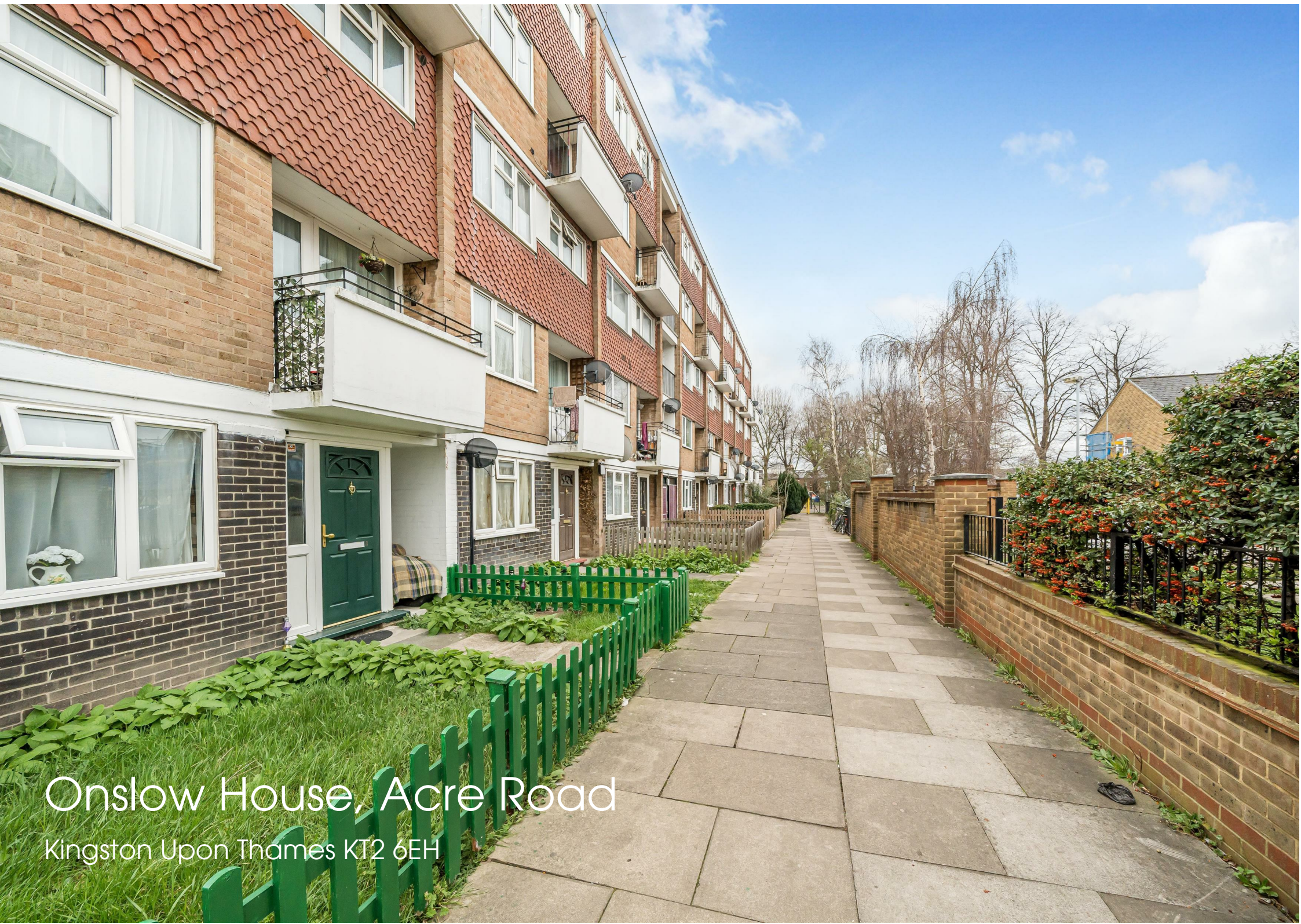
Onslow House, Acre Road Kingston Upon Thames KT2 6EH